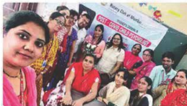
The course is conducted by Rotary Club of Mumbai in association with British Learning.