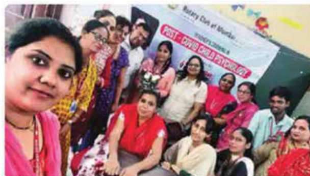
The course is conducted by Rotary Club of Mumbai in association with British Learning.