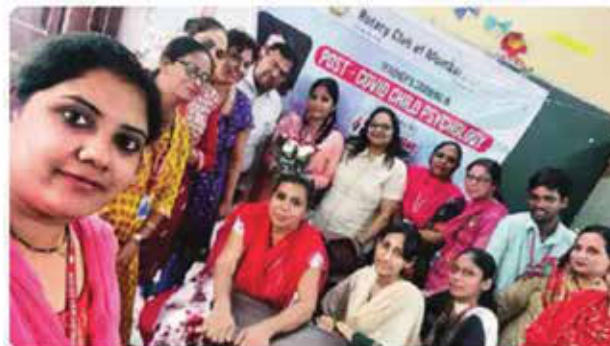
The course is conducted by Rotary Club of Mumbai in association with British Learning.