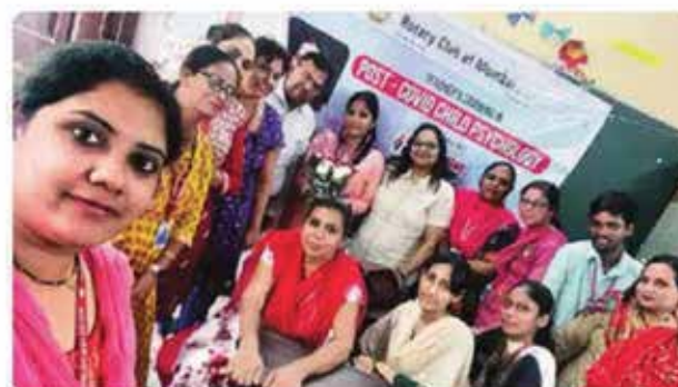
The course is conducted by Rotary Club of Mumbai in association with British Learning.